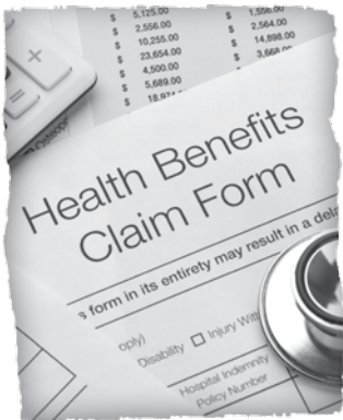
Figure 6.3: Example of a Policyholder’s Out-of-Pocket Responsibilities

Let’s say your maximum is $3,000, and you’ve already spent $1,800 out of pocket this year as shown in Figure 6.3. If you then got a medical bill for $10,000, the most you’d have to pay is $1,200. The insurance company would take care of the rest.